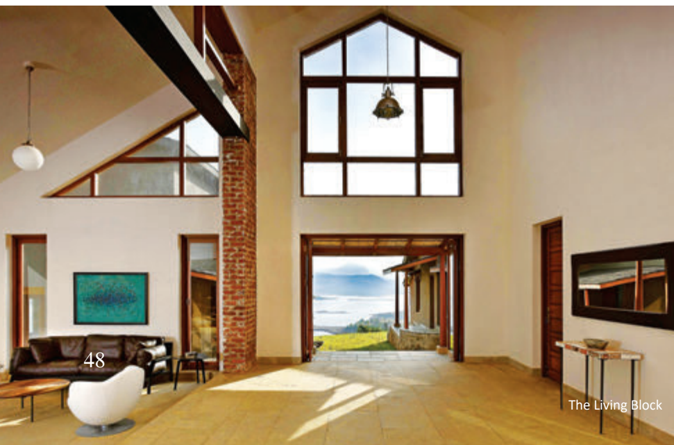
The Living Block

A simple and earthy palette of materials and tones – limestone (Shahabad & Kadappa), sandstone, slate, teak wood, terracotta tiles, exposed brick, cement plaster, and mild steel, complement the natural surroundings. The design evolved from a cohesive single unit to a structure that spreads out in blocks, with built and unbuilt spaces interlocking to create a whole. The unbuilt open spaces act as natural extensions that exist as distinct entities which seamlessly merge to convey the duality of space. As the extensions branch out in the form of bridges, the disparate blocks come together, effectively eliminating the sense of distance.