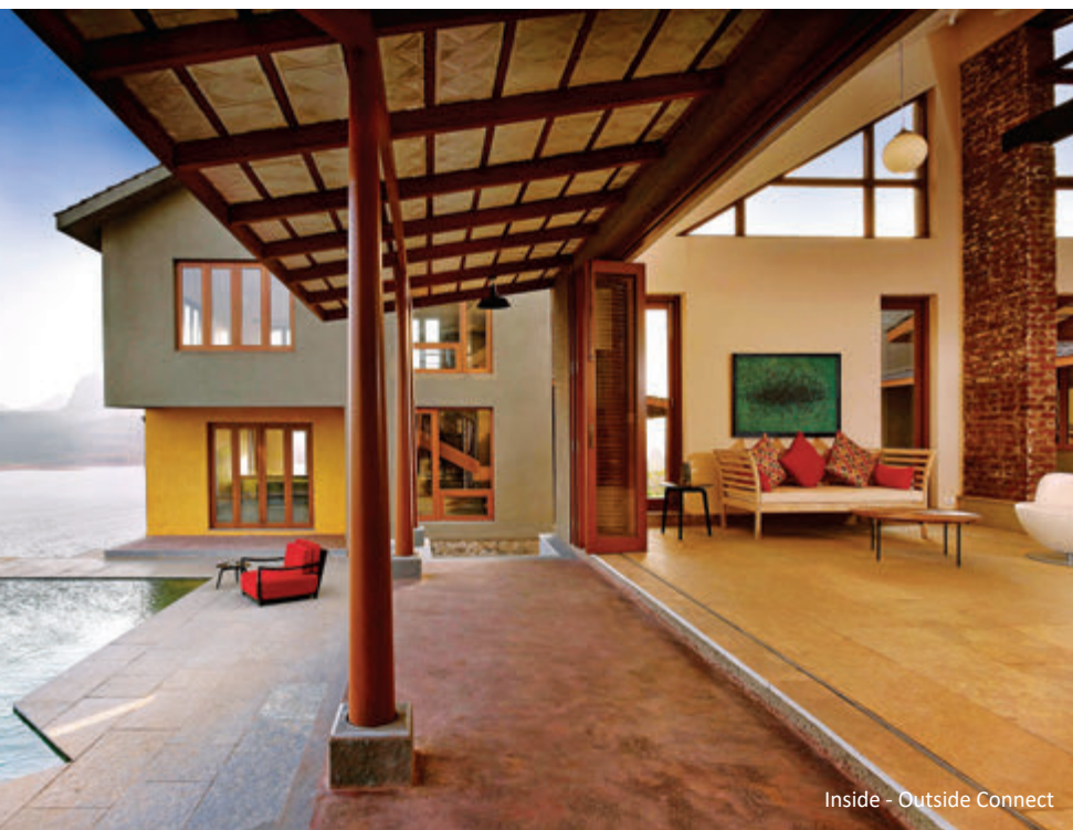
Inside - Outside Connect