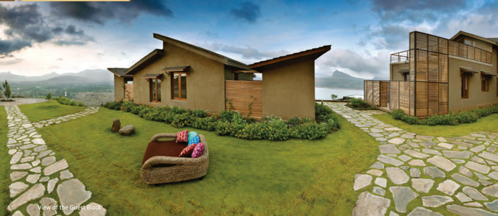
View of the Guest Block