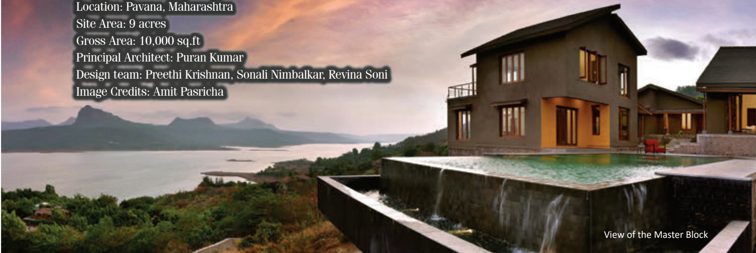
View of the Master Block